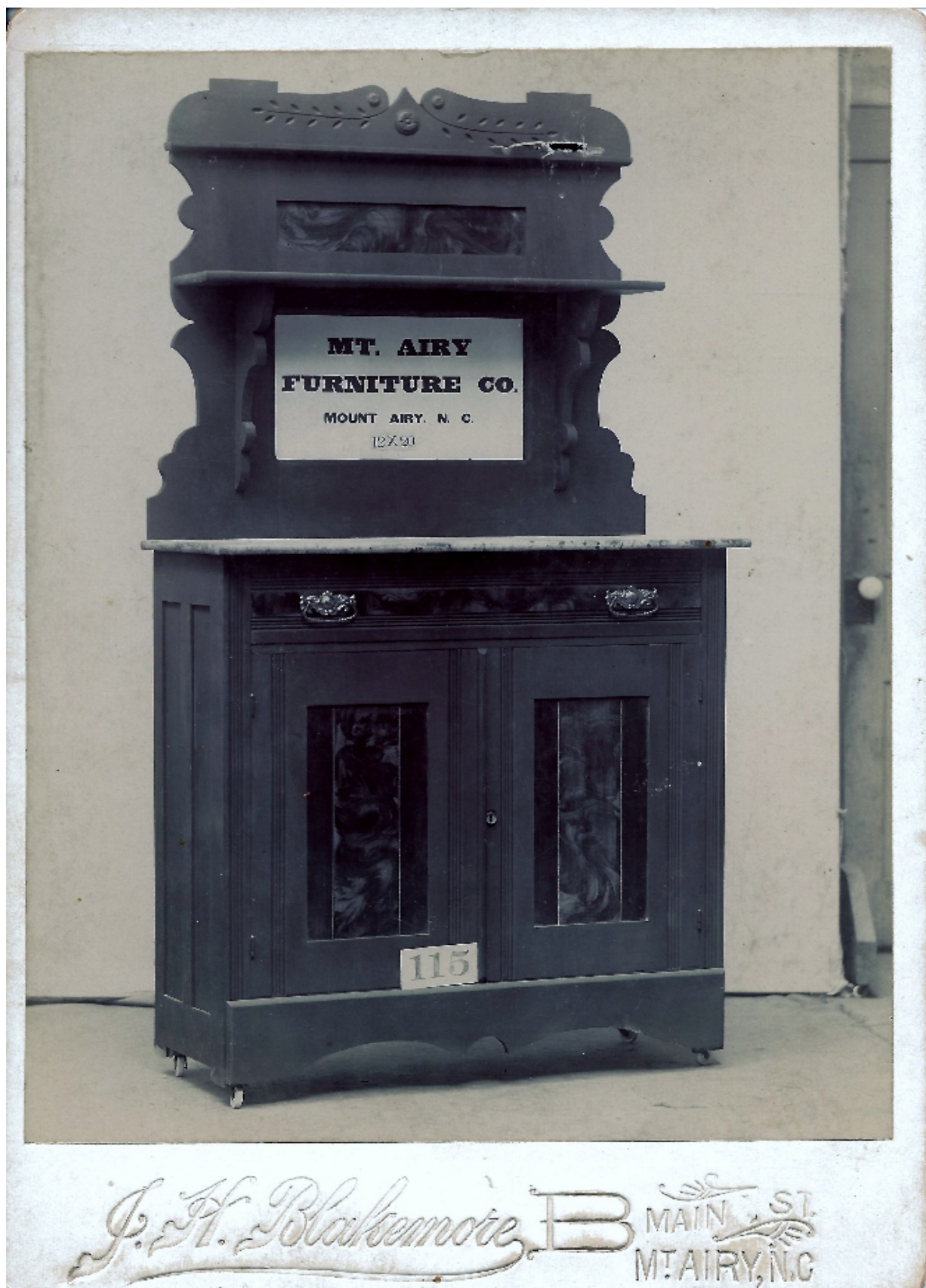
1897 Sales Card for Mt. Airy Furniture. Bed, Washstand and Dresser Suite Style #84 $7.75