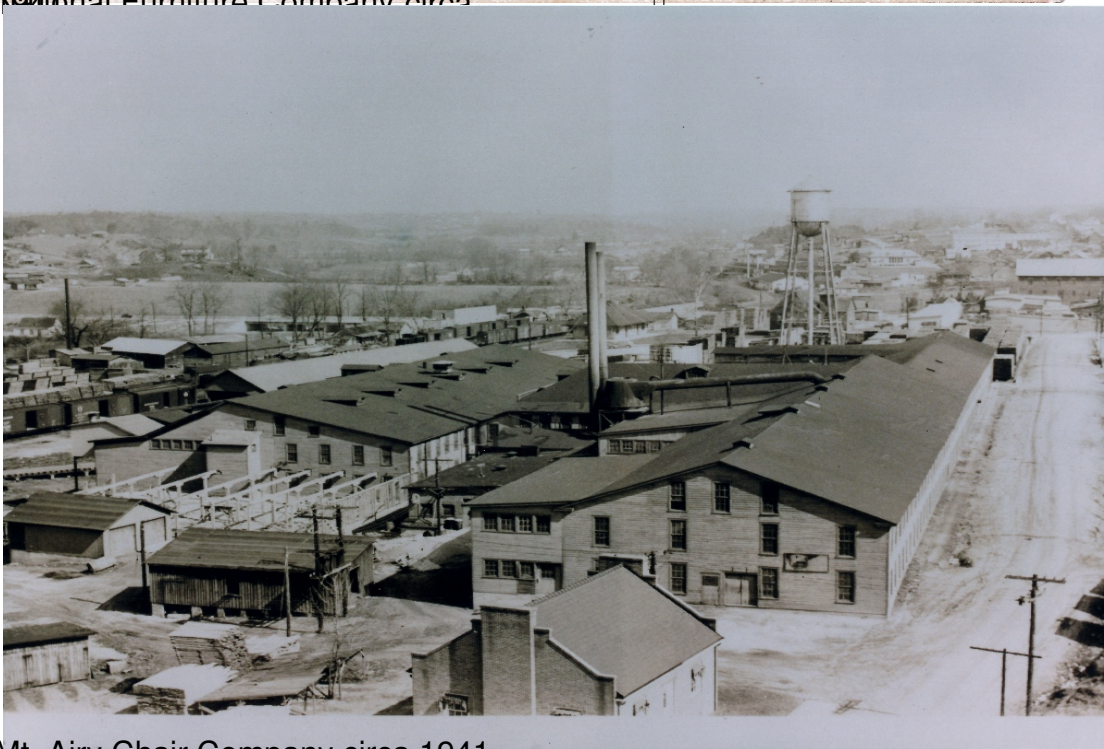
Mt. Airy Chair Company circa 1941