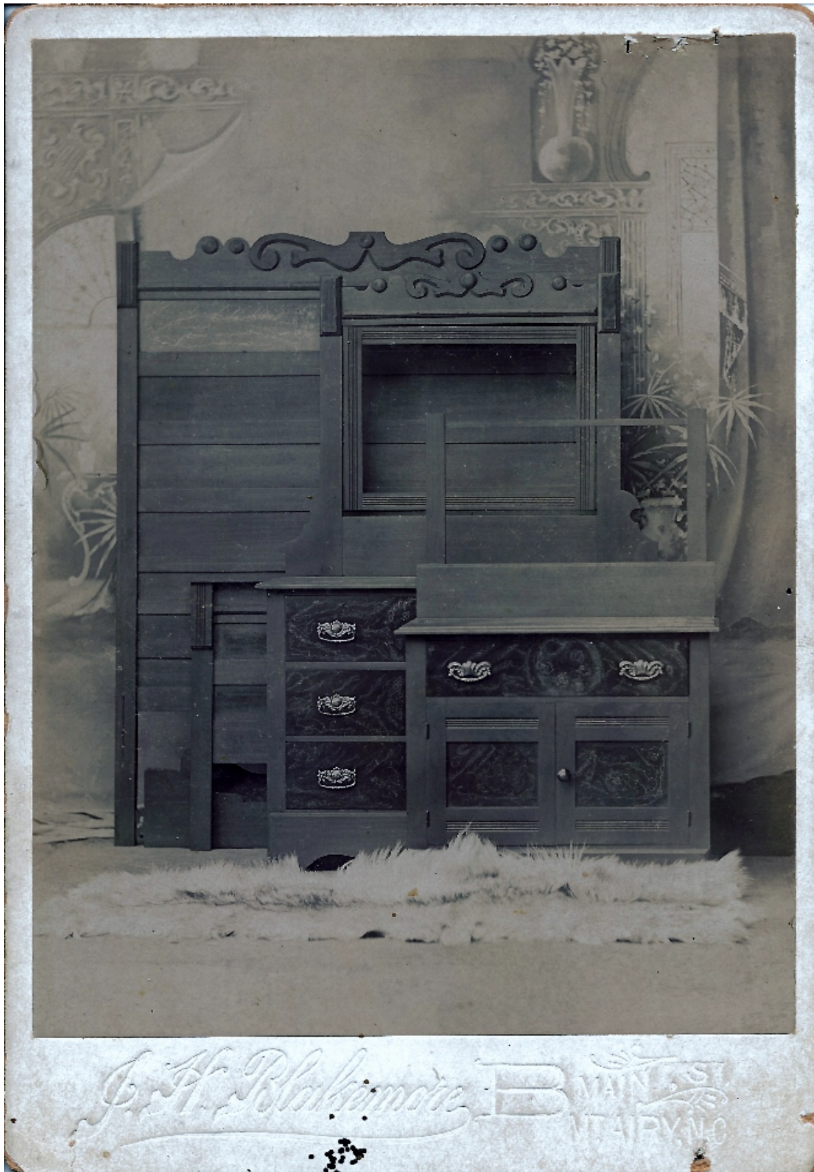
June 9, 1997 Fire at Mt. Airy Furniture Company