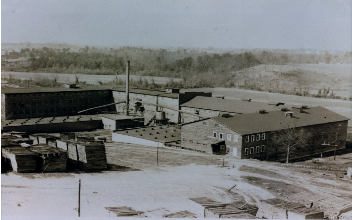
Mount Airy Furniture Factory