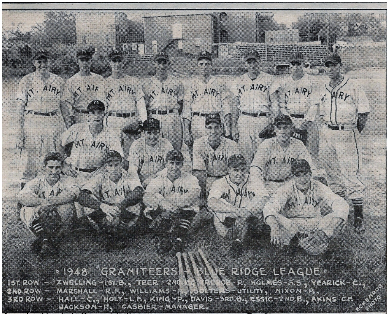
Amusing Umpire's Support Letter